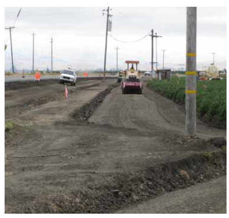
Compaction on Access Road