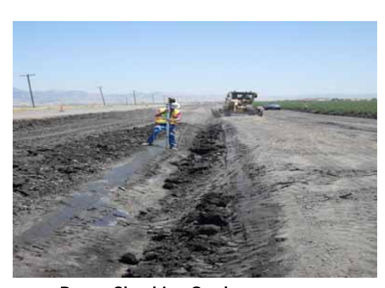
Pavex Checking Grade