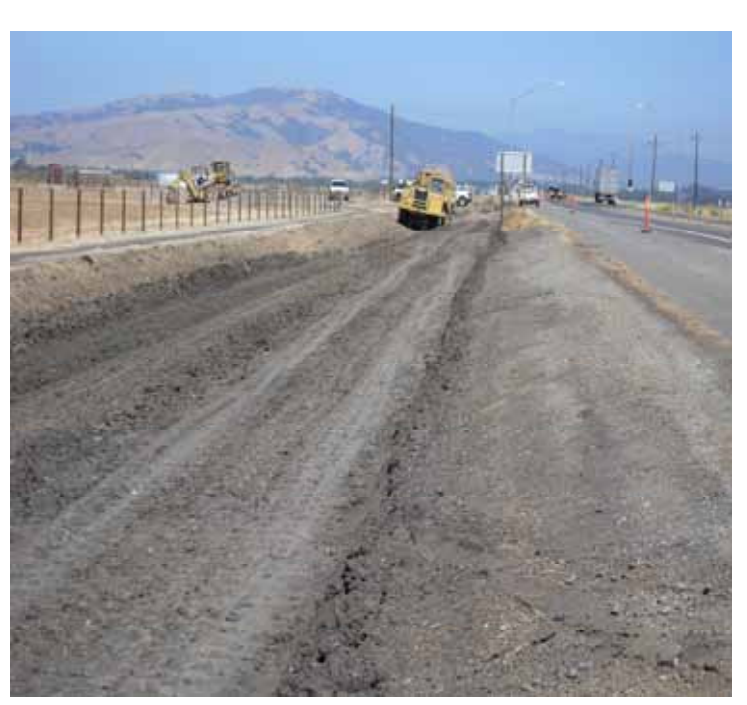
Embankment Area at Shore Road