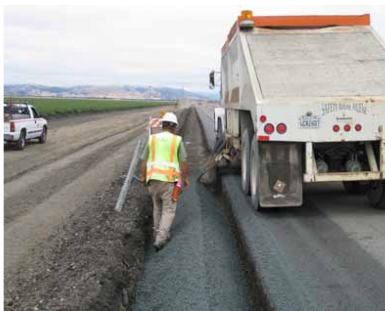
Pavex Placing Base on Shoulder